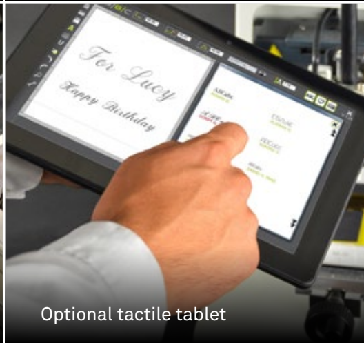
Optional tactile tablet