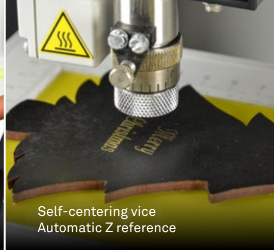
Self-centering vice Automatic Z reference