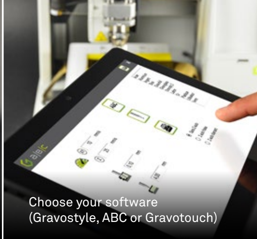
Choose your software (Gravostyle, ABC or Gravotouch)