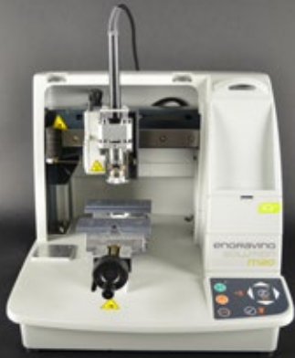
Compact hot foil transfer machine

M20 ArtFoil is the perfect solution for personalization using hot foil printing technology. You can personalize small items, leather goods, packaging, invitations, ... With a footprint of 345x315 mm and a weight of 12Kg, this is the most compact and the lightest Hot foil machine on the market. Controlled by a computer, the ArtFoil system eliminates expensive dies and costly set-up times, making even a single item hot foiling cost effective.