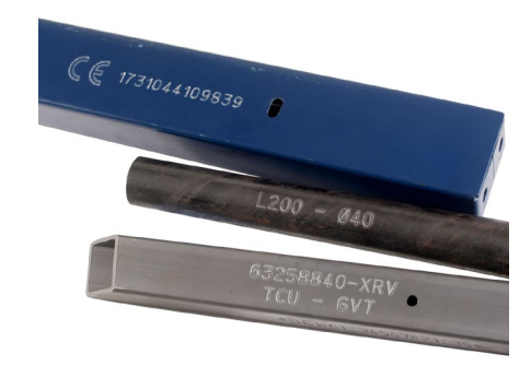
Painted, coated, raw materials