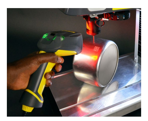
Hand-held or fixed-position scanner for code reading or checking