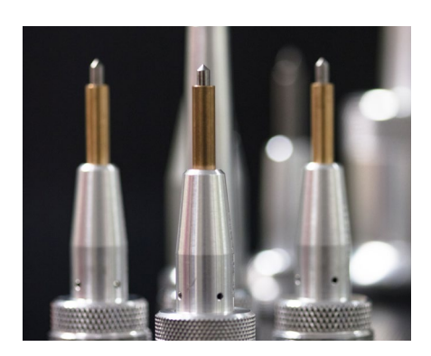
Wide range of high performance stylus marking tools