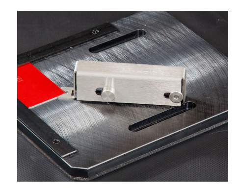
Sound-proof positioning plate with magnetic quick release clamp