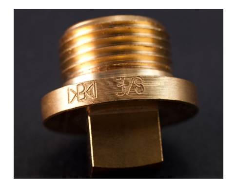
Various small parts