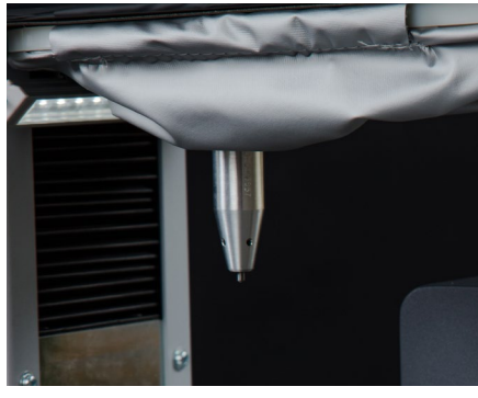
Protective bellow (optional)