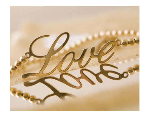
Fine metal cutting