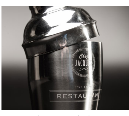
Gifts & personalization