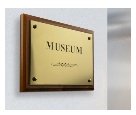
Professional and institutional plates