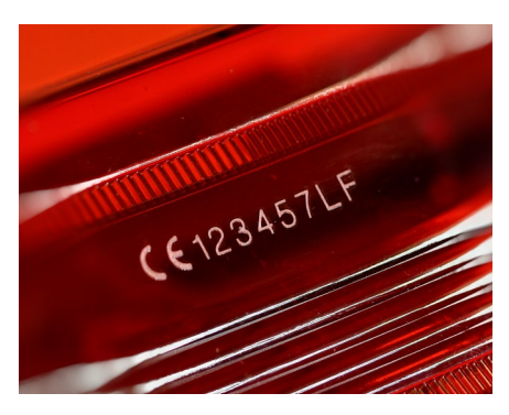
Glass & transparent plastics