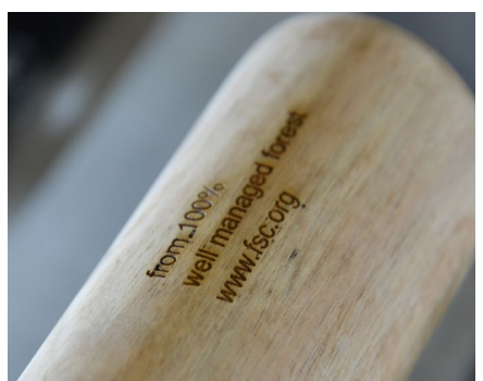
Marking on wood